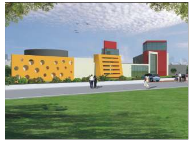
CLUB HOUSE C. P. 10